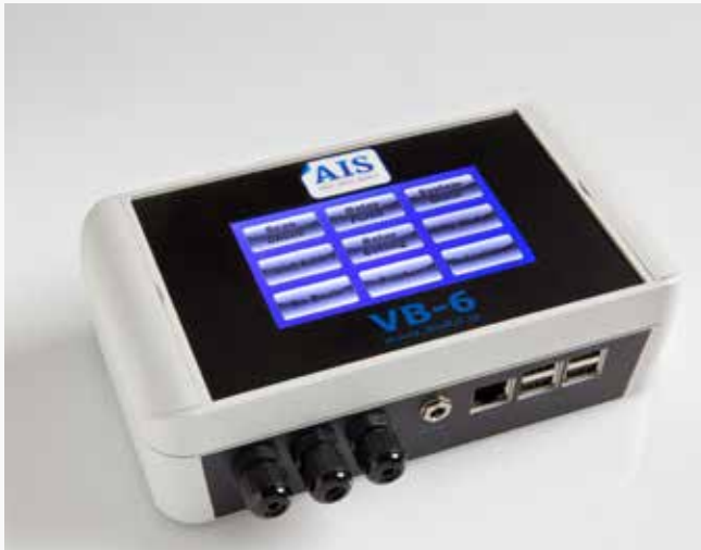
Main Menu Screen