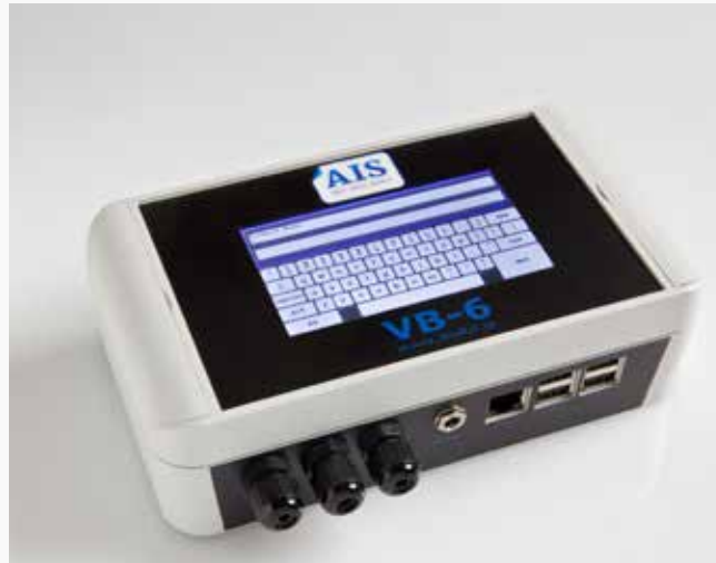
Full Keypad Functionality