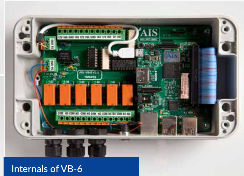
Internals of VB-6