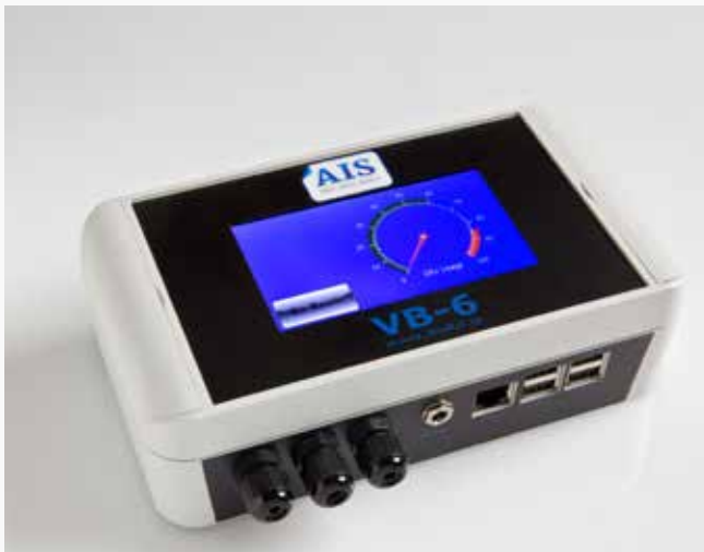
CPU Usage Meter